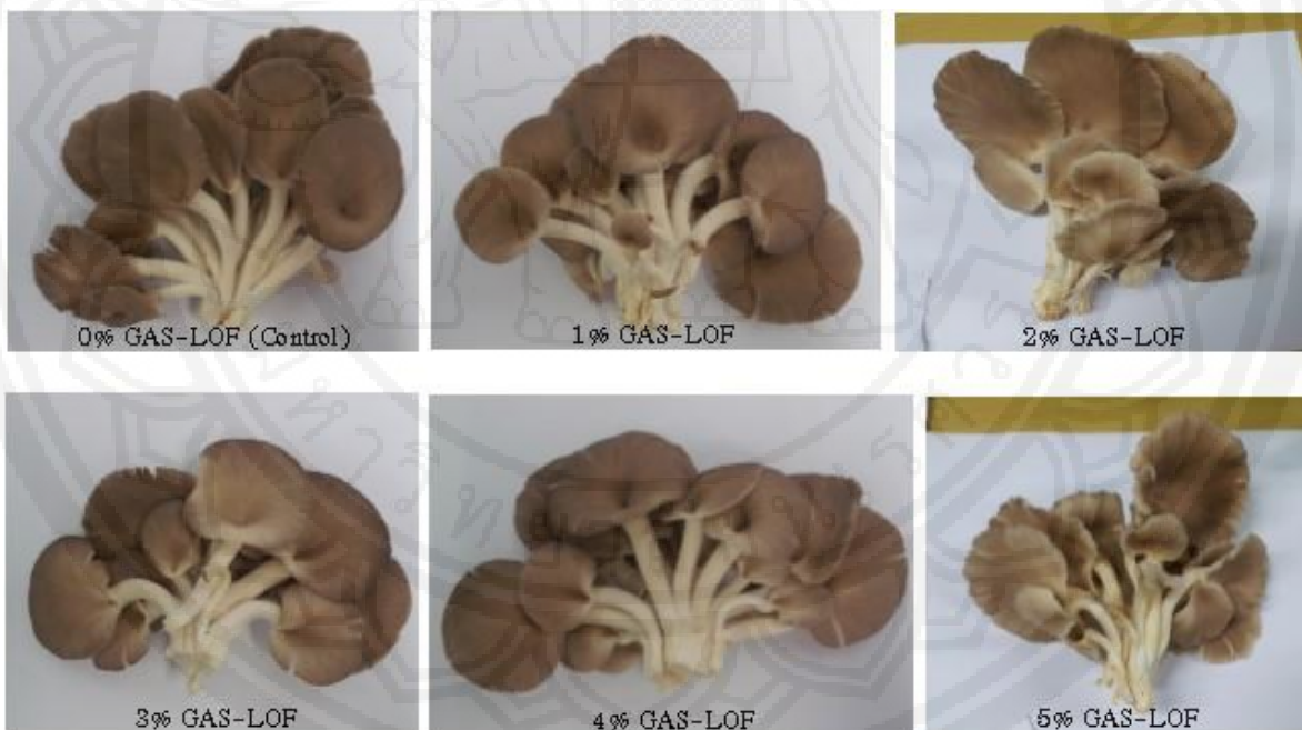
Figure 1 Shape of fruiting bodies of Pleurotus sajor-caju with 0% (control), 1, 2, 3, 4, and 5% GAS-LOF.

Pleurotus sajor-caju were cultivated on a rubber tree sawdust substrate with GAS-LOF supplement in different ratios for about 45 days (Figure 1). In this study, only 3 flushes of Pleurotus sajor-caju were harvested. The total yield was significantly different among the Pleurotus sajor-caju cultures with other supplement concentration (Table 1). The substrate with 4% GAS-LOF gave the highest total yield of fresh fruiting bodies of three flushes of Pleurotus sajor-caju , higher than obtained the control for 23% of the fresh weight.